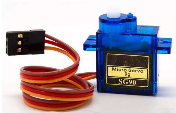
Figure 1: The SG90 Servo Motor.